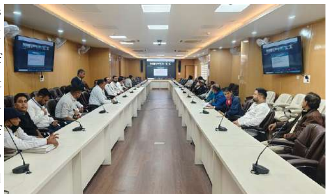
Participants attending the Training Programme on Effective & Efficient Process Serving on 12 th November, 2025.