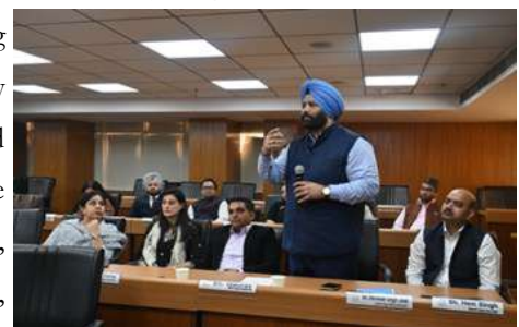
Participants engaging during the Reflective Training for Newly Posted Officers on 14 th November, 2025.