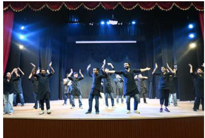
Artists of Sukhmanch Theatre Group performing a stage play on Plight of Trafficked Victims during the Judicial Colloquium on Anti-Human Trafficking on 22nd November, 2025.