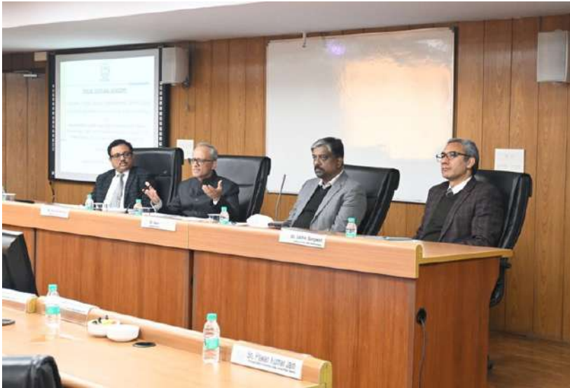
Hon'ble Mr. Justice Anoop Kumar Mendiratta, Former Judge, High Court of Delhi addressing the participants during Conference of policy makers / implementers at district courts level for strengthening district courts and capacity building on 20 th December, 2025.

Kumar Mendiratta, Former Judge, High Court of Delhi. These sessions discussed writing Annual Confidential Reports of officers, disciplinary issues, disposal of cases and unit systems, allocation and transfer of cases, synergy with the High Court, State Government, and the Bar. Discussions highlighted accessible and responsive court systems, effective case flow management, safeguarding institutional integrity, cyber security, infrastructure and IT management, development of differently-abled friendly courts, public grievance redressal mechanisms, and the Citizens' Charter. The conference enabled meaningful interaction and served as a platform for sharing experiences, identifying best practices, and reinforcing collaborative approaches for strengthening district courts and improving the overall quality of justice delivery.