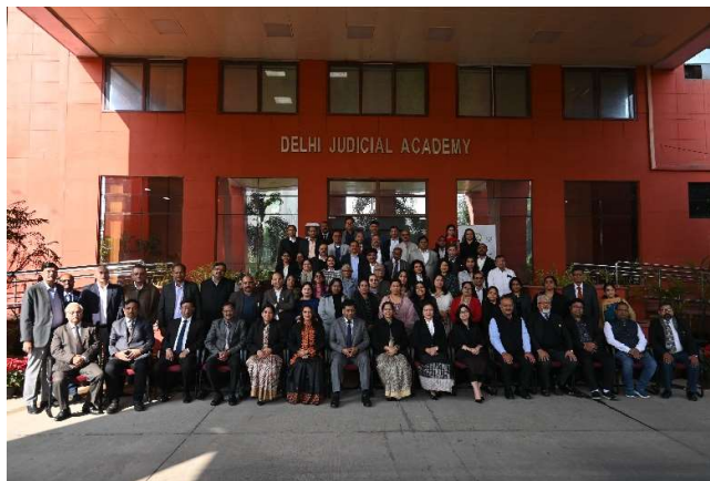
Participants of the Refresher Programme on Mediation held on 27 th November, 2023.

In collaboration with and under the aegis of the Mediation and Conciliation Project Committee (MCPC), Supreme Court of India, a Refresher Programme for mediators of MCPC in the Supreme Court was conducted at the Delhi Judicial Academy from 25 th November, 2023 to 27 th November, 2023. Sessions employed several interactive techniques such as group discussions, role plays and presentations by participants. As many as 75 mediators in three batches of 25 each participated in the said programme. Similar programmes for five days were held from 05 th December, 2023 to 10 th December, 2023. Six batches of 25 mediators each attended the programmes in the said five days.