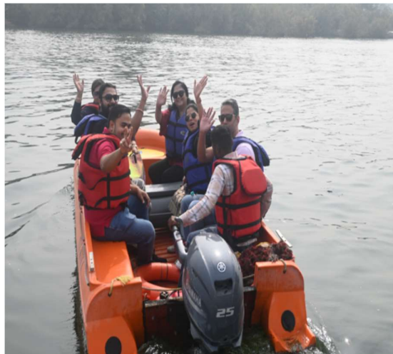
Judicial officers on retreat to Orchha, Madhya Pradesh from 25 th -27 th November, 2023.