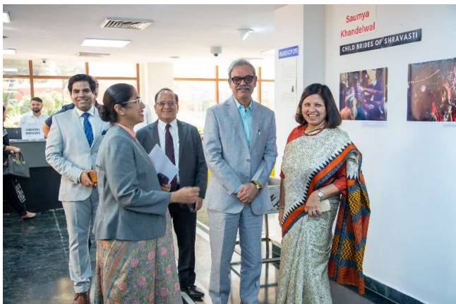
Glimpse of the Photo Exhibition organised on 14th October, 2023 exhibiting the work of photographer, Saumya Khandelwal in the Auditorium.

In the Workshop on Gender Sensitisation, an exhibition of photographs by prominent photo journalists enlisted below was organised on the concept of gender identity and gender based violence. Through these photographs, the participants saw the different dimensions of gender, its fluidity, the dark side of gender bias and disparities, discussed through the medium of visual journalism. The aim was to engage all the participants and to create an understanding of the implications of gender bias.