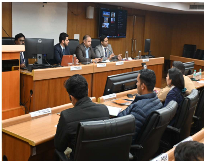
Participants of the Refresher Course held on 14th December, 2023 being addressed by resource persons

nuances of compounding under the aforementioned Act were discussed. In the post-lunch session, technology employed in court management was discussed. Focus was laid on how cases are registered, hybrid proceedings are conducted and daily docket is maintained.