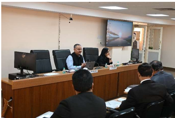
Senior mediation trainers of MCPC imparting training to the participants on 25 th November, 2023.