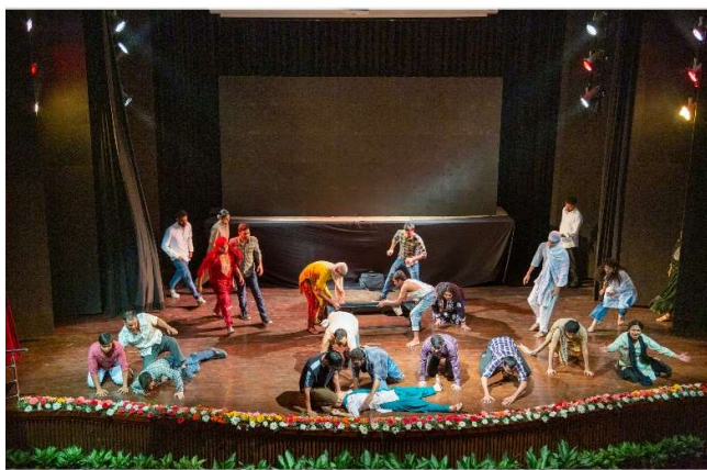
Theatrical performance by Sukhmanch Theatre team on "Impact of Sexual Abuse on Victims" organised on 14th October, 2023 in the Auditorium.

In the Workshop on Gender Sensitisation, an exhibition of photographs by prominent photo journalists enlisted below was organised on the concept of gender identity and gender based violence. Through these photographs, the participants saw the different dimensions of gender, its fluidity, the dark side of gender bias and disparities, discussed through the medium of visual journalism. The aim was to engage all the participants and to create an understanding of the implications of gender bias.