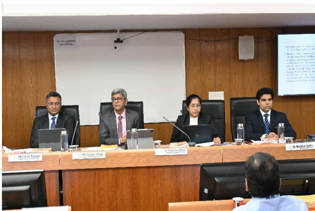
Hon'ble Mr. Justice Sanjeev Narula and Hon'ble Mr. Justice Amit Bansal addressing the participants in the post lunch session in the Refresher Course on IPR organised on 7 th October, 2023.

An intensive one day training was held for all District Judges (Commercial Court) on Intellectual Property Rights on 7 th October, 2023. Hon'ble Mr. Justice Navin Chawla, Judge High Court of Delhi and Mr. Rajshekhar Rao, senior advocate were the speakers in the first session. The prefatory session focused on issues pertaining to IPR vis-à-vis Human Rights as well as issues relating to jurisdiction and transnational disputes. In the following sessions, the resource persons discussed various kinds of interim measures and permissible reliefs which can be granted by the respective courts besides the issue of computation of damages. Hon'ble Mr. Justice Sanjeev Narula, and Hon'ble Mr. Justice Amit Bansal, Judges High Court of Delhi addressed the participants in the post-lunch session. Deliberations considered various modes of violation including cybersquatting, linking, framing, tagging caching etc. Concept of liability of intermediaries were also delved into. The day ended with a discussion on adjudicating disputes pertaining to Intellectual Property Rights in Cyber Space.