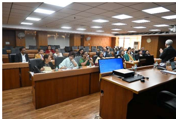
Participants of the Refresher Programme on Mediation held on 5 th December, 2023.