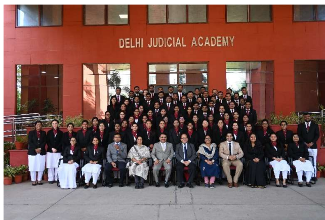
Training of 83 Newly Inducted Judicial Officers of Maharashtra Judicial Academy at Delhi Judicial Academy on 4 th to 9 th October, 2023

Eighty three newly recruited judicial officers of Maharashtra Judicial Service visited the Delhi Judicial Academy from 4 th to 09 th October, 2023. As a part of their training, they were inter alia made to understand the nuances of remand and bail and to observe court proceedings in the Delhi District Courts. The officers visited the Courts of Metropolitan Magistrates in Tis Hazari and Saket Courts. They also took a tour of the Mediation Centres and Family Courts housed in the said Court Complexes. They were also taken to the Vulnerable Witness Deposition Complex at Saket and Tis Hazari Courts. They also visited various heritage sites of historical and cultural importance in the capital.