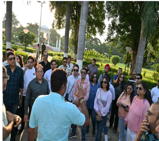
Judicial officers on retreat to Varanasi, Uttar Pradesh, from 27th-29th October, 2022