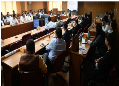
Core Competence Conference for Additional District Judges on 4 th November, 2023.

aid laid down in various judgments were discussed and assimilated. Training imparted focused on building a nuanced understanding of the legal framework pertaining to plea bargaining, compounding, sentencing and grant of compensation. In addition, both the programmes focused on recording and appreciation of evidence. An exhibition showcasing arms and ammunitions was also organised for the participants.