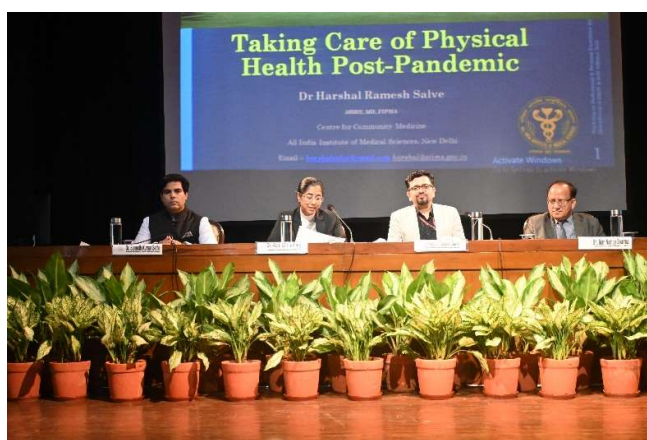
Workshop on Professional and Personal Excellence for Judicial Officers organised on 20 th October, 2023.

An optional training programme focusing on the overall development of the personality of a judicial officer was held in the Auditorium and the Club House of the Delhi Judicial Academy on 20 th October, 2023. The training programme aimed at taking care of the physical and mental toll that work takes on an officer compounded due to the COVID-19 pandemic. The programme primarily focused on learning how to take care of one's mental and physical health post the pandemic. Sessions were held by renowned psychiatrists and doctors from the field of medicine. A workshop was also held on functional yoga and on movement through physical training. Another session focused on achieving professional excellence by regulating emotional intelligence and achieving a work life equilibrium.