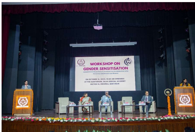
Inaugural session of the Workshop on Gender Sensitization chaired by Hon'ble Mr. Justice Siddharth Mridul, Chief Justice, Manipur High Court (then Judge, High Court of Delhi) & Hon'ble Ms. Justice Rekha Palli held on 14 th October, 2023.