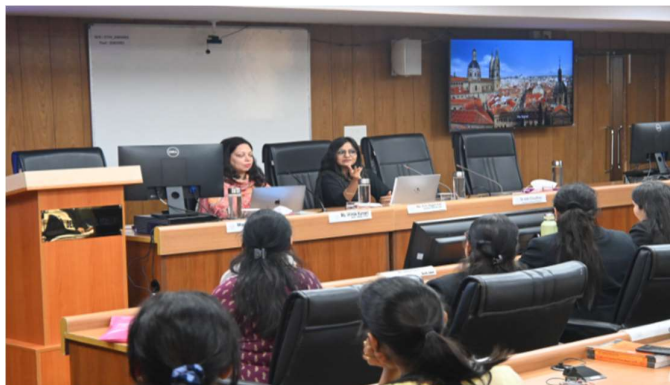
Sensitisation Programme for Police Officers handling Investigation of cases pertaining to Women and Children held on 21 st November, 2023.

A one day Conference to sensitise investigating officers in handling investigation of cases pertaining to Human Trafficking and sexual offences against women and children was conducted for additional Police Officials and Support Persons in Delhi Judicial Academy on 21 st November, 2023. The programme commenced by giving the participants a nuanced understanding as to what constitutes violence and how it adversely affects women and children more than anyone else. There was a focused discussion on what constitutes Human Trafficking. The session included a discussion on the menace of trafficking in the digital age. It was also felt important to underscore the victim's well-being and the psychological impact human trafficking entails. A clinical psychologist discussed different forms of impact that have been seen in victims, with the participants. The second day focused primarily on the legal matrix covering human trafficking as well as discussing the procedural issues faced by the police personnel while investigating and navigating the criminal justice system. The role of the police in rehabilitation of victims was discussed and emphasised in the last session.