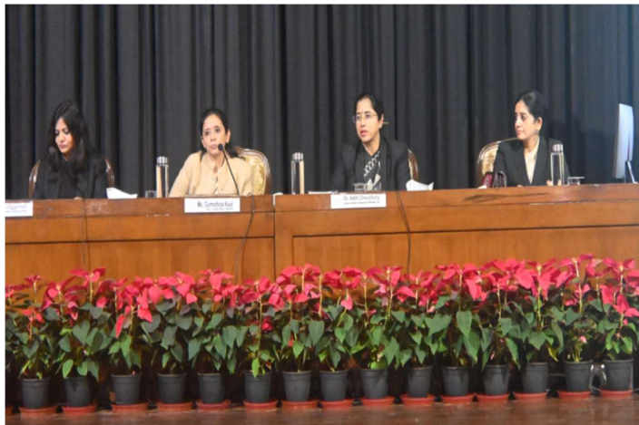
Core Competence Conference for Magistrates and Capacity Building for Prosecutors attached to Magisterial Courts organised on 2 nd December, 2023.

Two programmes were conducted for one third strength of CMMs, ACMMs and Magistrates as well as Public Prosecutors on 2 nd December, 2023. At the outset, the principles of remand and bail, the right to personal liberty and its interface with the constitutional vision were deliberated upon. Access to justice and responding to a vulnerable witness was also discussed. Further, the sessions looked at issues faced by the Magistrates at all stages of trial. Handling of miscellaneous applications as well as safeguards to be kept in mind while recording statements under section 164 Cr.P.C. were also deliberated upon. For the Public Prosecutors, sessions also covered considerations to be kept in mind while perusing a police report as well as the art of examining a witness. Directions passed in Siddharth v. State of U.P. CrI. Appeal No. 838/2021 and Satender Kumar Antil v. Central Bureau of Investigation SLP (CrI.) No. 5191/2021, were also discussed with the participants.