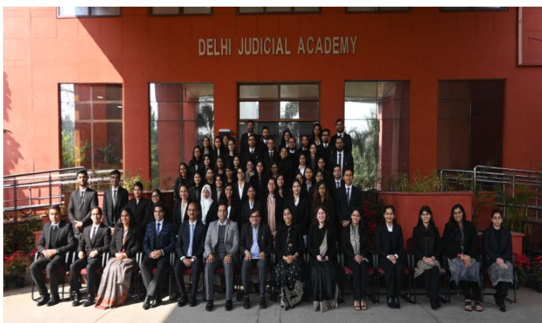
Left: Group Induction Trainee Judges with Hon'ble Dr. Justice S. Muralidhar, Former Chief Justice, Orissa High Court

ORIENTATION COURSE: Eighteen judicial officers of Delhi Higher Judicial Service on promotion joined the Academy for undergoing Orientation Course for one month. Post conclusion of training, the officers have been given postings.