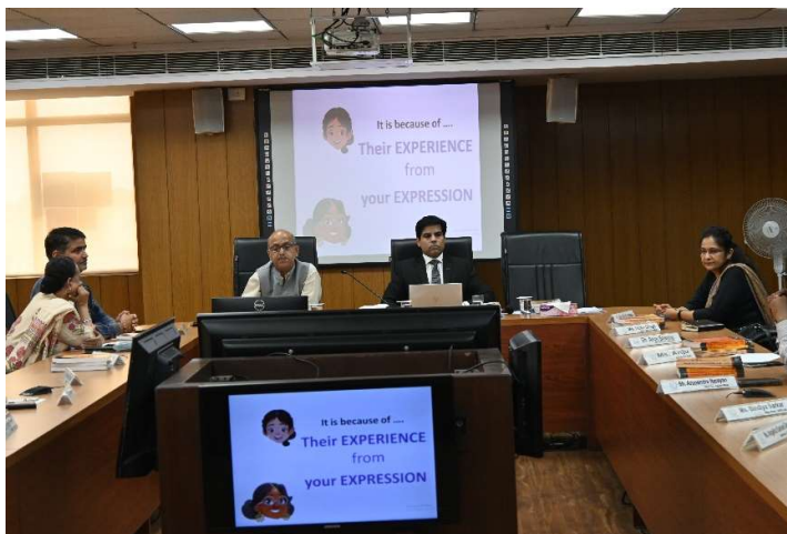
Stakeholders of the Juvenile Justice System attended two Workshops on Implementation of the Juvenile Justice (Care and Protection of Children) Act, 2015 and skill enhancement held on 6 th October, 2023.

A workshop on implementation of the Juvenile Justice (Care and Protection of Children) Act, 2015 for Principal Magistrates, JJB and another on enhancement of skills for other functionaries of the Juvenile Justice System were held on 06 th October, 2023. The workshops centered on coordination, enhancement of knowledge and development of rights perspectives of Chairperson and members of the Child Welfare Committees (CWCs), Officers of the Special Juvenile Police Unit, Member Social Workers and Principal Magistrates