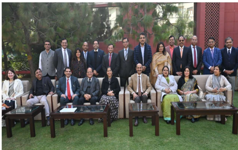
Participants of Conference of Policy Makers and Implementers at District Court Level for strengthening District Courts and Capacity Building

The Delhi Judicial Academy facilitated a discussion among all the Principal District and Sessions Judges, Principal Judges (Family Courts), Principal Secretary (Law and Justice), Government of NCT of Delhi, Member Secretary, Delhi State Legal Services Authority and Judges-in-Charge Mediation Centres for strengthening the District Court administration. Several administrative issues and challenges faced by different districts, including formation of administrative committees,