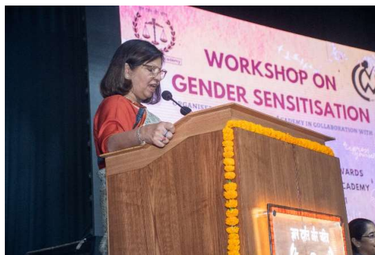
Left: Hon'ble Ms. Rekha Palli addressing the participants during the Workshop on Gender Sensitisation.

A Workshop on Gender Sensitisation was held in collaboration with National Commission for Women, for Judicial Officers, Public Prosecutors, Support Persons attached with Vulnerable Witness Deposition Centres, DLSA Secretaries and lawyers of the Rape Crises Intervention Centres on 14 th October, 2023 for building an inclusive justice delivery system. The sessions inter alia focussed on identifying bias, shattering stereotypes, intersectionality, impact of discrimination leading to reduced access to justice, search for the 'perfect victim' and gender inclusive language. It concluded with an educative theatrical performance by Sukhmanch Theatre Group led by Ms. Shilpi Marvah.