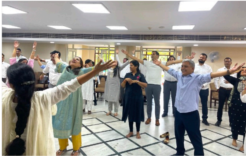
Workshop on learning basics of functional yoga in the Workshop on Professional and Personal Excellence held in the Club House of the Delhi Judicial Academy on 19 th May, 2023.