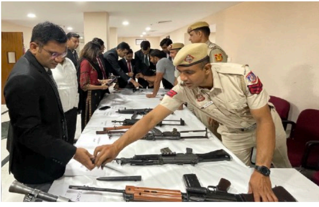
Arms and Ammunitions Exhibition organised for the Core Competence Conference for ASJs holding Special Courts under MCOCA/ UAPA/ NIA/ SC & ST' Act, 1989/ Rights of Persons with Disability Act, 2016/ Prohibition of Benami Property Transaction Act, 1988 and Conference of Capacity Building for respective Public Prosecutors held on 20 th May, 2023.

Two parallel training programmes were conducted on 20 th May, 2023 for ASJs holding Special Courts under Maharashtra Control of Organised Crime Act, 1999/ Unlawful Activities (Prevention) Act, 1967/ National Investigation Agency Act, 2008/ Schedule Caste and Schedule Tribe Act, 1989/ Rights of Persons with Disabilities Act, 2016/ The Benami Transactions (Prohibition) Act, 1988 and also the public prosecutors attached to the courts presided over by them. With Judicial Officers, discussions were held on issues of substantive and procedural law in the form of Question and Answer Sessions on the various Acts mentioned above. Points of discussion were centred around interpretation of core provisions, issues of remand, bail and interplay