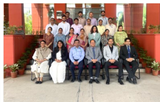
Right: Chief Probation Officer and Probation Officers of Delhi for training programme on 25 th April, 2023.

A half day programme was held on 25 th April, 2023 in which role and responsibilities of Probation Officers under the Probation of Offenders Act and the Juvenile Justice Act was discussed. Practical difficulties faced while preparing the probation report/social investigation report were discussed. Practical exercises and role play were employed to make the sessions interactive and informative.