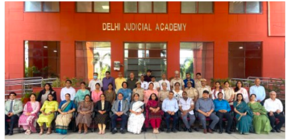
A group photo of the participants attending the Orientation Course on the Functioning of Juvenile Justice Board and Conference for Capacity Building for other functionaries of the Juvenile Justice System held on 12 th May, 2023.

An Orientation Course on the functioning of the Juvenile Justice Board and a Conference for Capacity building for other functionaries of the Juvenile Justice System were held on 12 th May, 2023. The programmes centred on coordination, enhancement of knowledge and development of rights perspectives of members and Chairperson of the Child Welfare Committees (CWCs), Officers of the Special Juvenile Police Unit, Member Social Workers and Principal Magistrates of Juvenile Justice Boards (JJBs), District Child Protection Units and Children's Courts. The programme facilitated dialogue and meaningful engagement on improving functioning of JJBs and CWCs. The core provisions of the Juvenile Justice law specifically concerning grant of bail, inquiry procedure, age inquiry and appreciation of evidence were focused on. The factors influencing development and psychology of a child, implementation of the right to education and supervision of Observation homes and Child Care Institutions were also probed further.