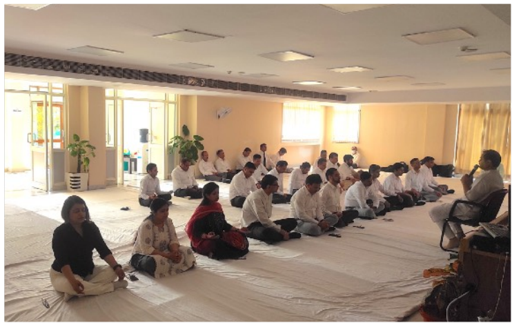
Yoga Session held for trainee DHJS officers undergoing foundation training on 10 th April, 2023 in the Club House of the Delhi Judicial Academy.