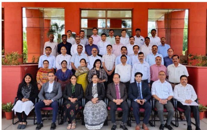
Group Photograph taken on 10 th May, 2023 of all participants attending the Workshop on Loopholes in Investigation and Legal Implications during Trial.

A two day workshop was organised on 9 th and 10 th May, 2023 for Assistant Commissioners of Police, Delhi Police. The Workshop focused on the Narcotics Drugs and Psychotropic Substances Act, 1985, Maharashtra Control of Organised Crime Act, 1999, National Security Act, 1980, Schedule Castes and Schedule Tribes (Prevention of Atrocities) Act, 1989 as well as aspects ranging from banking fraud and cheating to conducting inquiry under the relevant provisions of Code of Criminal Procedure. Methodologies such as mock trial were adopted in the sessions. A thought provoking movie titled "Article 15" was also screened for the participants as it highlighted the issue of discrimination based on caste and gender.