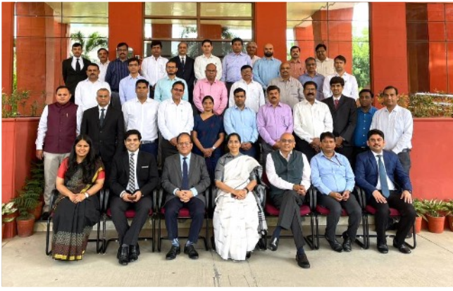
Group Photo with the Recovery Officers of Debt Recovery Tribunals from across India for training programme held from 29 th May, 2023 to 1 st June, 2023.