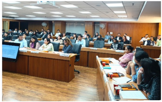
Participants attending the Orientation Course on the Mental Healthcare Act, 2017 on 26 th May, 2023 in the Seminar Hall of the Delhi Judicial Academy.

An Orientation Course on Mental Health was held on 26 th May, 2023 for judicial officers, police officials as well as mental health professionals. The training focused on comprehending mental health and mental illness with an increased focus on understanding “capacity”, both mental and legal, as envisaged under the UNCRPD. The finer nuances of Mental Healthcare Act, 2017, including the rights of persons with mental illness as enshrined in the Act along with the responsibilities of the stakeholders, were discussed. Case studies under the Act were also discussed. The law on fitness to stand trial and the defence of Insanity were deliberated upon. A professor of Psychiatry shared with the participants the medical process underlining making of a psychiatric assessment of the accused’s fitness to stand trial.