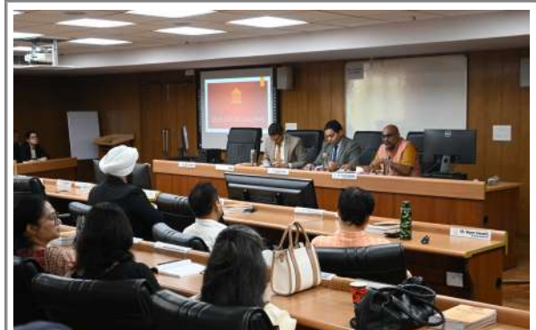
Resource persons addressing the participants on issues of barriers to accessing justice by children in conflict with law during the Workshop (Above and Below).

Workshop on the implementation of the Juvenile Justice Act for Children's Courts, Principal Magistrates and Social Worker Members, JJB, Public Prosecutors attached to such courts and members of Special Juvenile Police Unit and Workshop for Skill Enhancement for other functionaries of the Juvenile Justice System were held on 20 th July, 2024. The programmes centred on coordination, enhancement of knowledge and development of rights perspectives of all stakeholders. In the workshop on the implementation of the Juvenile Justice Act, discussion on drug abuse amongst CCLs and the role of JJBs in combating the same was discussed. Further, deliberations were held on the exercise of statutory right to appeal under Section 101(5) of the JJ Act. The first two sessions in the Workshop for Skill Enhancement focused on developing effective communication skills and counselling techniques, including a non-judgmental attitude and maintaining confidentiality. The last two sessions were held as convergent sessions for both workshops, where functions of Children's Court, JJB, District Child Protection Unit and Special Juvenile Protection Unit as under the Juvenile Justice Act, 2015 were discussed. Further, core provisions of the law, specifically concerning grant of bail and appreciation of evidence, were focused on along with the right stage of intervention and its kinds and methods of communication, in case of drug abuse.