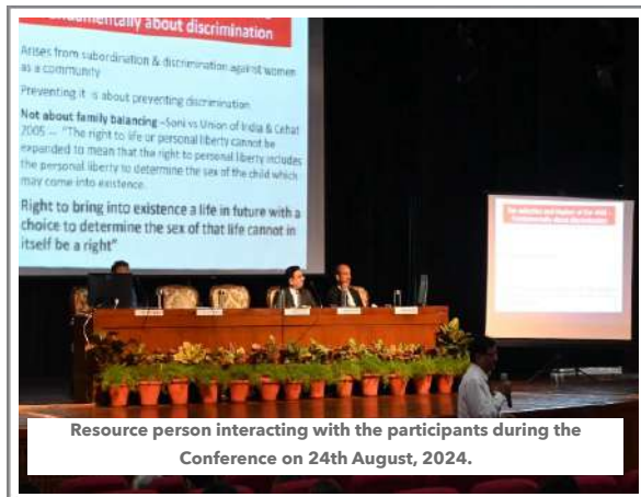
Resource person interacting with the participants during the Conference on 24th August, 2024.

A one-day conference was organized on 24 th August, 2024 for Judicial Magistrates First Class dealing with the cases pertaining to the PC & PNDT Act, the public prosecutors attached to their courts & police officials dealing with these cases. The conference deliberated on issues of medical termination of pregnancy & sex selection and demystifying the basic provisions of PC & PNDT Act, 1994. The procedure of de-sealing of machines, hospitals and clinics, filing of complaint, role of police & functions of authorities under PC & PNDT Act was also discussed. A movie depicting declining sex ratio & its impact on gender equality was also shown to the participants. The resource persons included officers from Directorate of Family Welfare & Director General Health Services, Delhi and Sh. Rakesh Syal, DHJS.