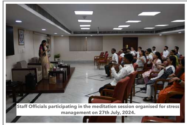
Staff Officials participating in the meditation session organised for stress management on 27th July, 2024.

Sensitisation programme for High Court Staff on Public dealing was held on 27 th July, 2024 for 34 staff personnel deployed at the Filing Counter/ Pass Counter/ Facilitation/ Help Desk/ EPABX of the High Court of Delhi. The session began with a discussion on how one should conduct themselves in public– the appropriate dress code as well as do's and don'ts. Research Wing of the Delhi Judicial Academy conducted a public survey through a questionnaire in order to understand the difficulties faced by the litigants while dealing with the registry, results of which were shared with the participants. Necessary sensitivity, that is required to be maintained while dealing with persons belonging to marginalised sections, was also discussed. A session was held specifically on how to handle grievances including how to give a patient hearing to a litigant and the essential communication skills. Further the programme delved into an overview of the Citizen's Charter and identification of best practices. Lastly, considering the nature of public dealing intensive work undertaken by them, a hands-on session on yoga exercises and pranayama/meditation was conducted to help them with stress management.