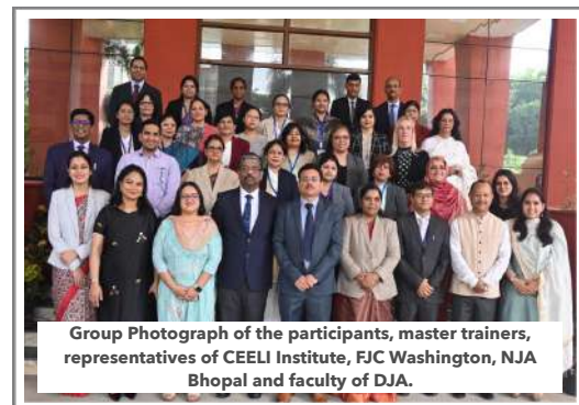
Group Photograph of the participants, master trainers, representatives of CEELI Institute, FJC Washington, NJA Bhopal and faculty of DJA.

Washington in collaboration with the National Judicial Academy, Bhopal for the training of 25 judicial officers (one participant each having been nominated by each High Court in India) on issues such as money laundering, narcotics, cyber-enabled human trafficking, cyber-crime and digital evidence. All the participants and resource persons stayed at the Judicial Hostel of the Academy during the Workshop.