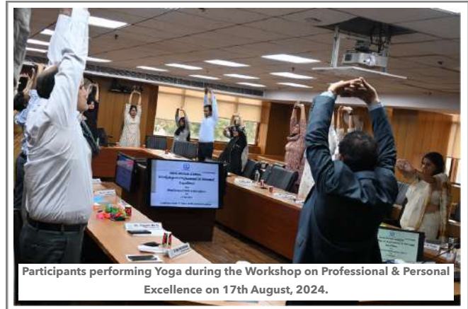
Participants performing Yoga during the Workshop on Professional & Personal Excellence on 17th August, 2024.

An optional training programme focusing on the overall development of the personality of a judicial officer was held on 17 th August 2024. The training programme aimed at taking care of the physical and mental toll that work takes on an officer compounded due to the COVID-19 pandemic. The programme primarily focused on learning how to take care of one's mental and physical health post the pandemic. Sessions were held by renowned psychiatrists and doctors from the field of medicine. A workshop was also held on functional yoga and on movement through physical training. Another session focused on achieving professional excellence by regulating emotional intelligence and achieving a work life equilibrium.