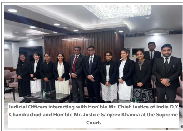
Judicial Officers interacting with Hon'ble Mr. Chief Justice of India D.Y. Chandrachud and Hon'ble Mr. Justice Sanjeev Khanna at the Supreme Court.

Seventy-Nine officers of the Delhi Judicial Service of the Batch of 2023 continued their induction training in this quarter. The batch of officers underwent practical training through court attachments, institutional training and substantive field training in this quarter. The officers visited the Parliament, Rashtrapathi Bhawan, Aanchal Special School for Children with Special Needs, NALSA, Slums, IFSO and Supreme Court of India, amongst several other eminent institutions for their field training. At the Supreme Court of India, the officers also interacted with Hon'ble Mr. Chief Justice of India D.Y. Chandrachud and Hon'ble Mr. Justice Sanjeev Khanna, Judge, Supreme Court of India and received their able guidance and blessings. The officers also attended a week-long induction course in Forensic Science at National Forensic Science University, Delhi in August 2024. A half day debate competition organized for the officers was also met with tremendous enthusiasm at their end. Upon completion of the one-year training for seventy-two officers, they were put on court attachments. The institutional training for seven judicial officers who had joined late, continued in this quarter.