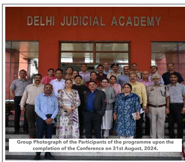
Group Photograph of the Participants of the programme upon the completion of the Conference on 31st August, 2024.

A two-day Conference to sensitise investigating officers in handling investigation of cases pertaining to Human Trafficking and sexual offences against women and children was conducted for additional DCPs and ACPs in Delhi Judicial Academy on 30 th and 31 st August, 2024. The programme commenced by giving the participants a nuanced understanding as to what constitutes violence and how it adversely affects women and children more than anyone else. There was then a focused discussion on what constitutes Human Trafficking. The focus of the session was on trafficking in the digital age. It was also felt important to underscore the victim's well-being and the psychological impact both short term and long term, that a victim faces. A clinical psychologist discussed the different forms of impact that have been seen in victims, with the participants. The second day focused primarily on the legal matrix covering the issue as well as discussing the procedural issues faced by the police personnel while investigating and navigating the court machinery. A session was dedicated to ways to identify both visible and hidden disability; and the solutions to remove the barriers to access to justice. Their role in rehabilitation was discussed and emphasised in the last session.