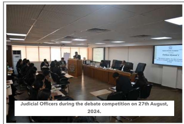
Judicial Officers during the debate competition on 27th August, 2024.