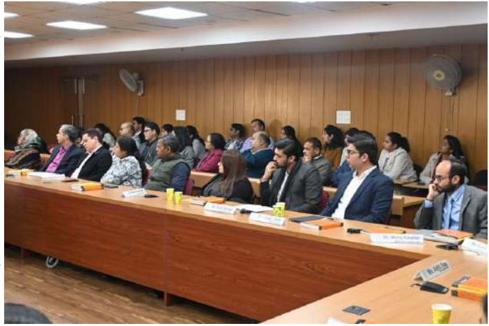
Participants attending the Conference on the Pre-Conception and Pre-Natal Diagnostic Techniques (Prohibition of Sex Selection) Act, 1994 on 7 th February, 2026

The third session addressed trial process and procedural issues under the PC and PNDT Act. Key provisions of the Act were examined in detail. The discussion included procedural issues like cognizance, role of police, dealing with complaint and charge sheet in the same case and the significance of judicial precedents. The final session continued with deliberations on trial process and procedural challenges, focusing on appreciation of evidence, judgment writing and best practices for inter-agency coordination. The importance of effective trial management and adherence to statutory mandates was highlighted,