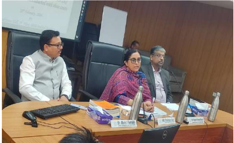
Hon'ble Ms. Justice Shalinder Kaur, Former Judge, High Court of Delhi addressing the participants during Core Competence Conference for Knowledge, Skill and Perspective Development on 28 th February, 2026.

A one-day Core Competence Conference for Knowledge, Skill and Perspective Development was conducted on 28 th February, 2026 for ASJs (POCSO)/ASJs (FTSC) (POCSO)/ASJs (SC) (POCSO) and Prosecutors attached to these courts. The first session focused on adopting a justice-oriented and child-centric approach while dealing with cases under the POCSO Act. The historical background and constitutional underpinnings of child protection laws were discussed to contextualize the legislative intent. The deliberations emphasized sensitive handling of children with disabilities, bail considerations and the necessity of recording reasoned orders. The importance of supplying a copy of final judgment to the victim, ensuring provision of legal aid and addressing rehabilitation, including interim and final compensation under the Act, was highlighted. The session also touched upon informing the Child in Conflict with Law of the statutory right to appeal under Section 101(5) of The Juvenile Justice Act, 2015.