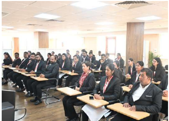
Students from Abhinav Law College, Pune attending a session at Delhi Judicial Academy on 12 th February, 2026.

A group of law students from Abhinav Law College, Pune visited the Delhi Judicial Academy on 12 th February, 2026 as part of their academic exposure programme. The students were given an overview of the role and functioning of the Academy and its training initiatives for judicial officers. An interactive session was also held, providing the students with valuable insights into judicial education and the functioning of the justice delivery system.