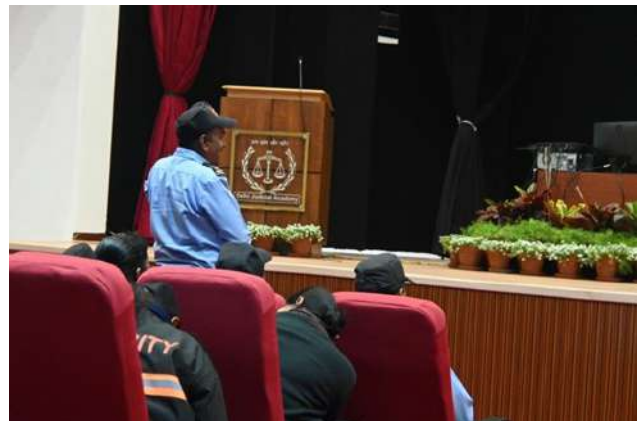
Participants engaging during the Awareness Programme on the Sexual Harassment of Women at Workplace (Prevention, Prohibition & Redressal) Act, 2013 on 30 th January 2026.