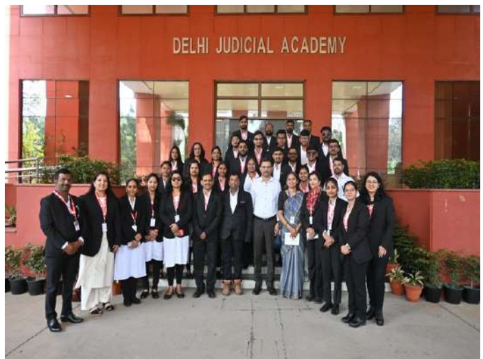
Group photograph of law students from Abhinav Law College, Pune.