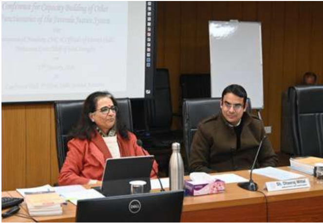
Hon'ble Ms. Justice Poonam A. Bamba, Former Judge, High Court of Delhi engaging with the participants during the Conference for Capacity Building of Other Functionaries of the Juvenile Justice System on 17 th January 2026.

A one-day Conference for Capacity Building of Other Functionaries of the Juvenile Justice System was organized on 17 th January 2026. The programme was conducted for half the strength of Chairpersons and Members of Child Welfare Committees (CWCs) and officials of District Child Protection Units (DCPUs). The inaugural session focused on the functions of the Child Welfare Committee, highlighting statutory responsibilities relating to conducting age inquiries, assessment of Children in Need of Care and Protection (CNCP), declaration of children legally free for adoption and handling cases involving children with disabilities. The session emphasized the need