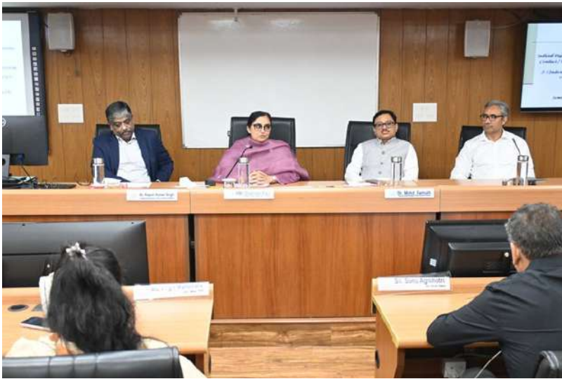
Hon'ble Ms. Justice Shalinder Kaur, Former Judge, High Court of Delhi, addressing the participants during Training Programme on Contempt and Courtroom Conduct / Handling Disruptive Behaviour and Contempt of Court on 7 th March 2026.

A one-day training programme was conducted on Judicial Dignity and Discipline: Training on Contempt and Courtroom Conduct / Handling Disruptive Behaviour and Contempt of Court on 7 th March 2026. The programme was attended by the nominated Judicial Officers from each district court. The programme commenced with session focussed on understanding contempt and disruptive behaviour. The session deliberated upon gendered dimensions of courtroom conduct, particularly the