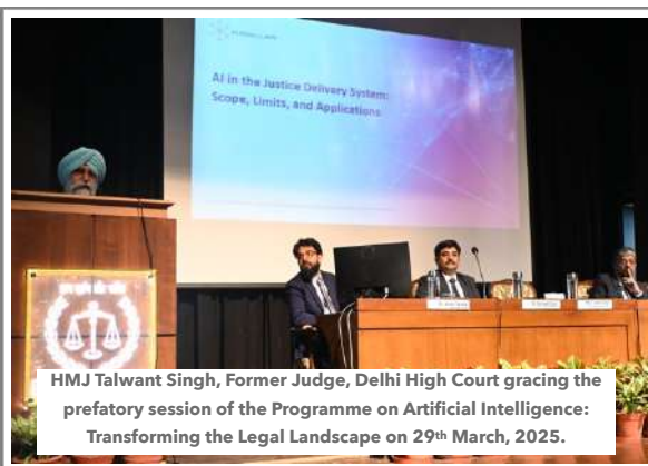
HMJ Talwant Singh, Former Judge, Delhi High Court gracing the prefatory session of the Programme on Artificial Intelligence: Transforming the Legal Landscape on 29 th March, 2025.

A one day training programme was organised on 29 th March 2025 for a mixed group of DHJS and DJS officers on Artificial Intelligence: Transforming the Legal Landscape. This was an optional programme, which was attended by 170 officers. The programme began with an introductory session on the meaning, scope and ambit of Artificial Intelligence and its application in the justice delivery system. Hon'ble Mr. Justice Talwant Singh, Former Judge, Delhi High Court chaired the first session, with Mr.