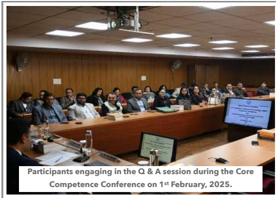
Participants engaging in the Q & A session during the Core Competence Conference on 1 st February, 2025.

disabilities and the practice directions to be followed while dealing with bail applications. The best practices to be adopted for ensuring expeditious disposal of cases were also deliberated upon. Two sessions were conducted in question-and-answer format, wherein challenges faced by the participants in the implementation of key provisions of POCSO Act were considered. The deliberations were held around the recording of statement of the victim, maintaining the