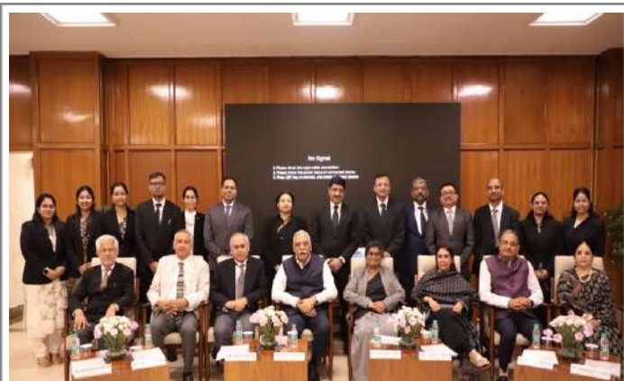
Group Photograph of the officers of the Induction Training Programme with the Hon'ble the Chief Justice, High Court of Delhi, Hon'ble Companion Judges, High Court of Delhi and Hon'ble JETPC upon conclusion of the Valedictory Function on 24 th April, 2025.