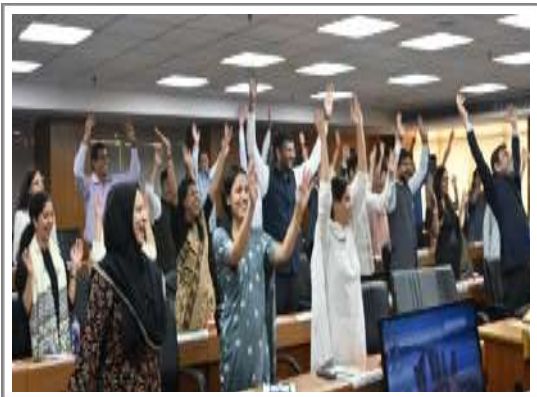
Left: Participants performing mobility exercises during the Workshop.