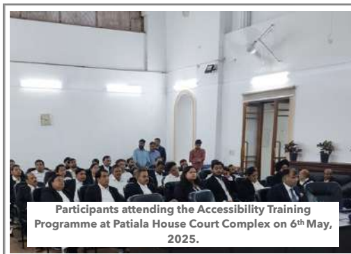
Participants attending the Accessibility Training Programme at Patiala House Court Complex on 6 th May, 2025.