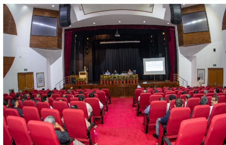
(Above) Training Sessions on Cyber Laws were held in the Auditorium of the Delhi Judicial Academy.

A session was also undertaken on the ever-changing landscape of cyber offences and disputes including within its ambit cyber stalking, cyber porn, data theft, online financial fraud, cyber-squatting, phishing, hacking, ransomware, crypto currency etc.