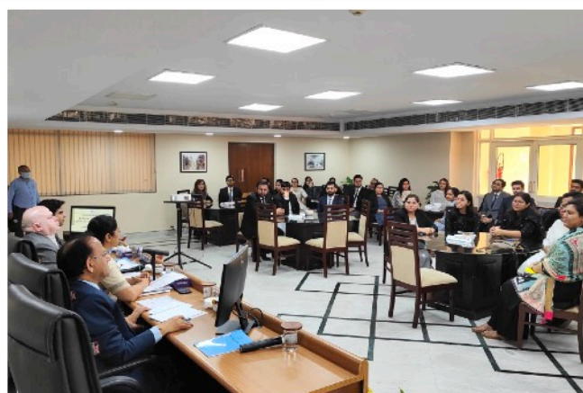
(Above) Reflective Trainings held in the Club House of the Delhi Judicial Academy.

Two Reflective Training programmes for the June and July 2019 batches of Delhi Judicial Services were organised to assess the impact of learning during the one-year induction training. Discussions revolved around Court management, Case management, Court Administration and Infrastructure related issues, relationship between the Bar and the Bench, dealing with staff and litigants, as well as other aspects of Court functioning. A documentary titled "All Rise for Your Honour" was also shown to the participants highlighting the issues plaguing the judicial system and the perceptions of the common man. The programme also served as a robust platform for the Academy to get a feedback about the training modules used and the correctional steps which can be taken for the future for making induction training more pertinent and effective.