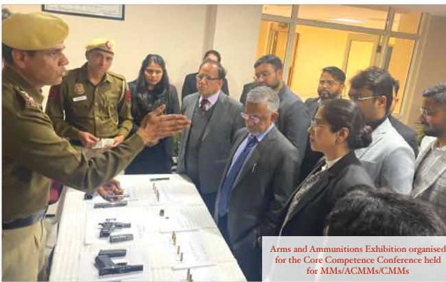
Arms and Ammunitions Exhibition organised for the Core Competence Conference held for MMs/ACMMs/CMMs