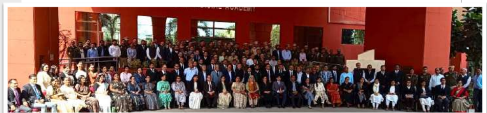
Attendees of the 'Convergence Workshop of Stakeholders on the POCSO Act' organised on 25 th February, 2023.

A Core Competence Conference was organised on 24 th and 25 th February, 2023 for knowledge, skill and perspective development for judicial officers holding POCSO Courts which included a convergence workshop of stakeholders in its two sessions attended by public prosecutors and around 150 police officers who handle investigation in such cases. Broad ranging deliberations were held around challenges in implementation of the POCSO Act, from recording of statement of the victim, maintaining the victim's privacy, determination of age, sentencing and compensation and issues of bail. The historical and social framework of Child Sexual Abuse was discussed. A session was also dedicated to understanding the growing concern of child sexual abuse in the Cyber Space. In an attempt to further sensitise the participants, a documentary titled 'Hush Hush' underscoring the impact of Child Sexual Abuse on victims and the still prevalent persistent societal stigma was shown to the participants.