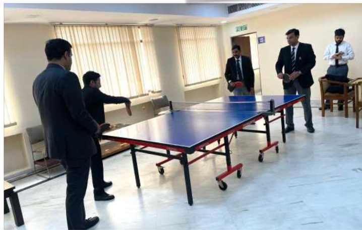
Judicial Officers enjoying the recreational facilities at the Clubhouse, Delhi Judicial Academy to unwind and relax in the breaks between sessions in training programmes.