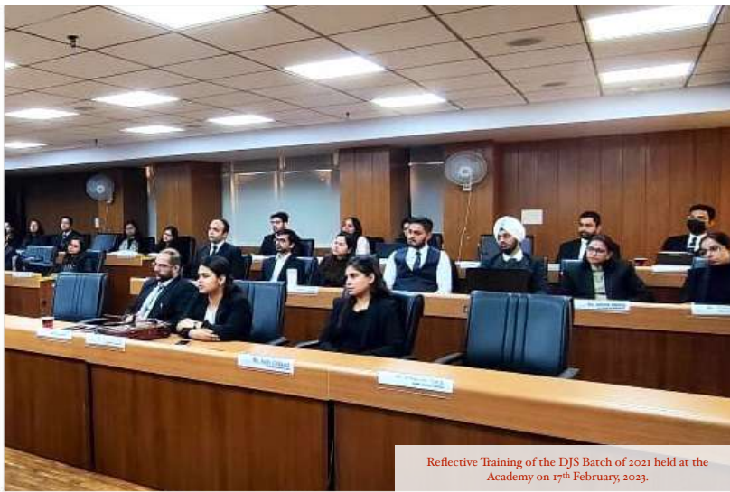
Reflective Training of the DJS Batch of 2021 held at the Academy on 17 th February, 2023.

Two Reflective Training programmes were organised. The reflective training for the DHJS (Direct Recruit) batch of 2021 and the promoted batch of 2022 was held on 17 th March, 2023 and for the DJS batch of 2021, it was held on 17 th February, 2023. Discussions revolved around Court management, Case management, Court Administration and Infrastructure related issues, relationship between the Bar and the Bench, dealing with staff and litigants, as well as other aspects of Court functioning. A documentary titled 'All Rise for Your Honour' was