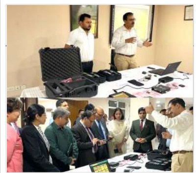
An exhibition of equipment used in collection, preservation, analysis of digital evidence and cyber forensics organised by FSL, Delhi in the Academy.

Other sessions centred around collection, preservation, handling, disposal and appreciation of digital evidence as well as the role, liability, responsibilities and immunity of intermediaries. The programme also had a first of its kind exhibition held by experts from the FSL, Delhi who showcased and demonstrated the working of various imaging and analysis tools used in mobile forensics and disk forensics.