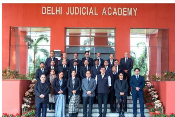
Special Metropolitan Magistrates (Littering) who underwent training at the Delhi Judicial Academy from 10 th to 23 rd January, 2023

Induction training programme was conducted for 17 Special Metropolitan Magistrates/ Special Municipal Magistrates (Littering) at the Delhi Judicial Academy from 10 th January, 2023 to 23 rd January, 2023. The Special Metropolitan Magistrates were imparted institutional training for 5 days and were on practical attachment for the remaining days to familiarise them with court functioning. Their institutional training covered basic concepts of Delhi Petty Offences (Trial by Special Metropolitan Magistrates) Rules, 1998, New Delhi Municipal Council Act, 1994, Delhi Municipal Corporation Act, 1957, Delhi Water Board Act, 1998,